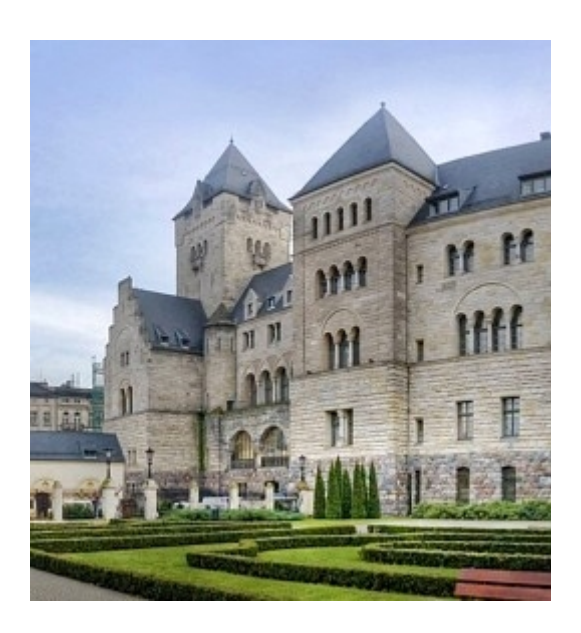
and on towards the Independence and Market Squares.